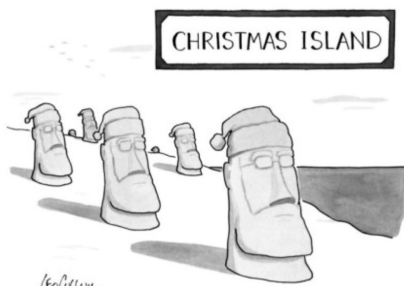
Leo Cullum, The New Yorker, 2012