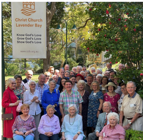
Some of the Christ Church morning congregation: traditional in format but moving with the times

The Reserve Bank estimates that in 2022 as little as 6% of all transactions were in cash. In our day to day lives, we are encouraged to transact electronically. With offertories, this has advantages over cash. It is "set and forget". A person need think about it once, make a decision, then not have to think about it again. It could be revisited at some later interval – eg annually. It also means that being absent or on holidays doesn't cause disruption. In addition, it saves time, labour and is much safer for our volunteers who need to count and bank cash offertories. If you are not already giving this way, details as follows: Recipient: Christ Church Lavender Bay, BSB: 633000 Account: 158400747 And please include the word "Offertories".